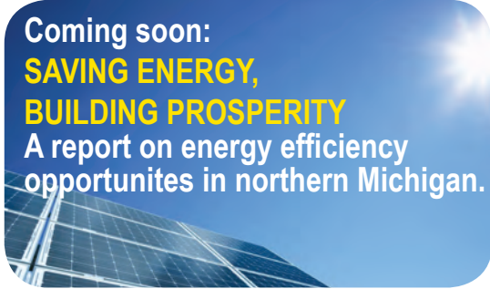
Coming soon: SAVING ENERGY, BUILDING PROSPERITY A report on energy efficiency opportunities in northern Michigan.

Michigan Land Use Institute 148 East Front Street, Suite 301 Traverse City, MI 49684