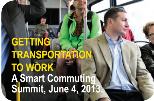
GETTING TRANSPORTATION TO WORK A Smart Commuting Summit, June 4, 2013.