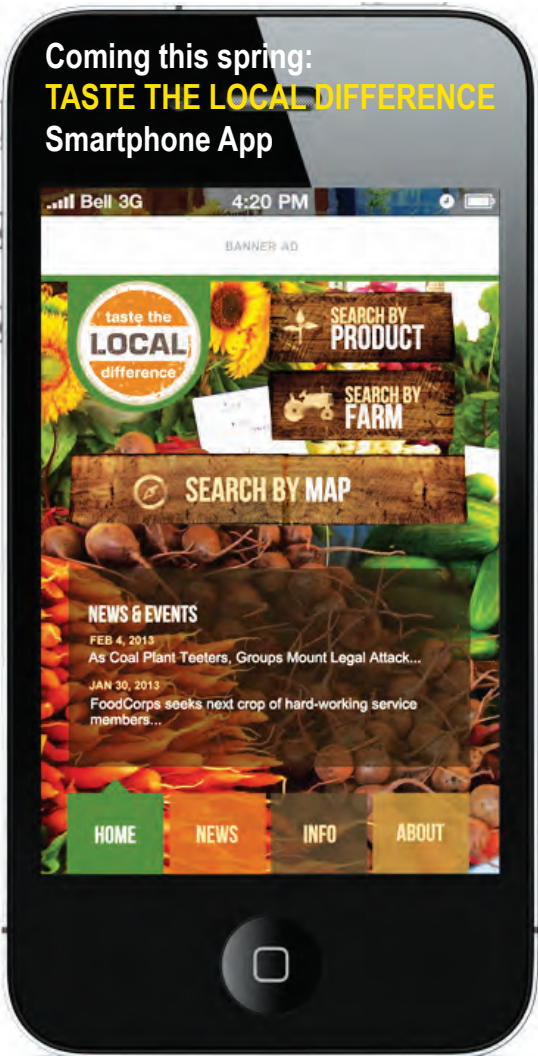
Coming this spring: TASTE THE LOCAL DIFFERENCE Smartphone App